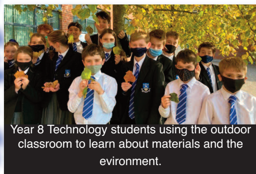
Year 8 Technology students using the outdoor classroom to learn about materials and the environment.